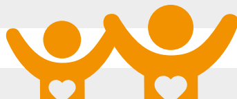
Data Source: Street Tag Active Lives Survey, 901 total respondents

+6.66% in players walking 30 minutes or more per week to 84% (757) in total